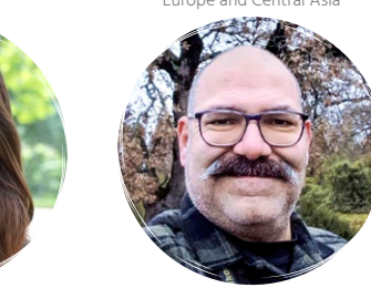
ITRI LEVENT Consultant for Recovering Nature in the East (RENATE) - Caucasus & Turkey