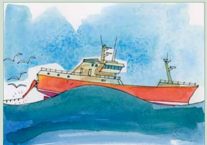
Figure 2. In rough weather, the setting chute becomes less effective.