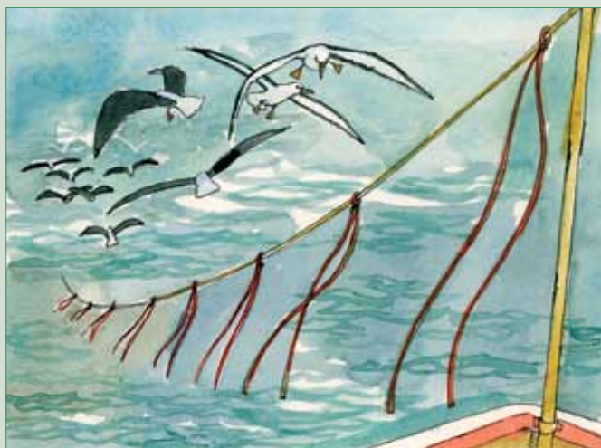
Figure 1. Streamer lines deter seabirds from feeding on baited hooks.

When deployed properly under suitable conditions, streamer lines can be very effective at reducing seabird mortality. For example, in the North Atlantic experimental trials showed a 98% reduction in seabird bycatch (Løkkeborg, 2003) when a streamer line was used. In Alaska, paired streamer lines have the potential to reduce seabird bycatch of surface feeding species, primarily northern fulmars and Laysan albatrosses, by 88–100% (Melvin et al. , 2001). However, in this fishery shearwater bycatch rates remained unchanged, as their superior diving abilities allow them to target baits beyond the effective protection of the streamer lines.