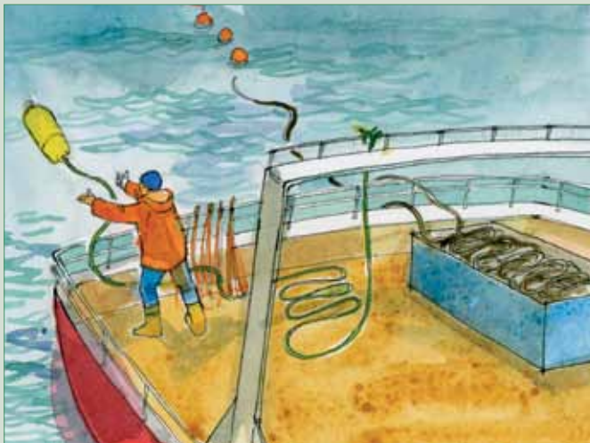
Figure 2. Streamer lines should be deployed before the first hook leaves the vessel.