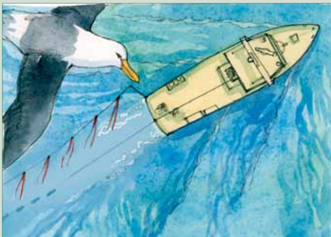
Figure 1. From the air, blue-dyed squid merge with the surrounding water.

The dyeing process requires bait to be fully thawed before they can take up sufficient dye. Food colouring, such as Virginia Dare FD C Blue No. 1 or E133, is commonly used. In Brazil, a company that specialises in food colouring, Mix Industria, has developed a dye to specifically to colour fishing bait. Depending on the concentration of the dye and the desired colour, bait is soaked from 20 minutes to four hours. Comparison with a colour card determines when the desired colour has been achieved. Bait is often refrozen after dyeing and used in a semi-frozen state to improve bait retention on hooks.