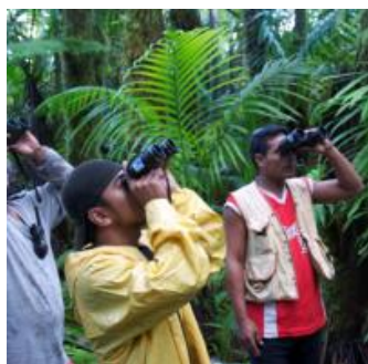
CSP staff searching for the elusive starling.