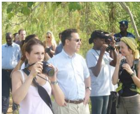
Birdwatching with the French and Belgian Ambassadors to Burundi

The closing ceremony was marked by the handing over of the first prize for the drawing contest organised for primary schools of Bujumbura.