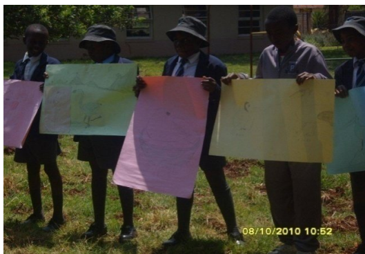
Drawing competition © BLZ

Children sang, danced, made speeches and played drums portraying many aspects of birds and bird conservation including the phenomenon of bird migration. Schools were given bird books and other education materials as a token of appreciation for the attendance. This event was filmed throughout and a DVD of it will come out soon.