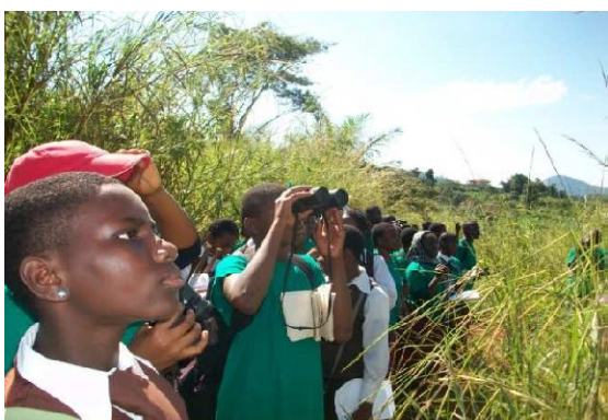
Activities of CBCS

Ebe for dance, songs, poems, sketches and debates. The coordinator also explained why we need birds and thanked the Jensen Foundation for providing funds for the event. Birds are important in pest control, seed dispersion, ecotourism, and serve as honey guides, pollinators, messengers and as a source of fertilizers, for arts and culture and as warning lights. The lead teachers were encouraged to carry on with EE in their respective clubs so as to extend the impact of EE to higher heights. It was reemphasized that bird watching requires patience, sharp eyes, and a strong desire to discover the world of birds in our surroundings.