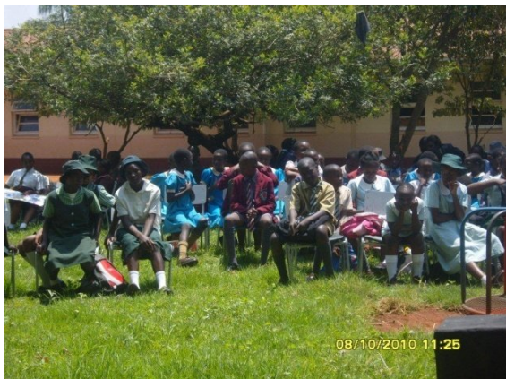
Future conservation leaders in Zimbabwe

birds and the environment due to human activities and urged young people to participate in the conservation of the environment.