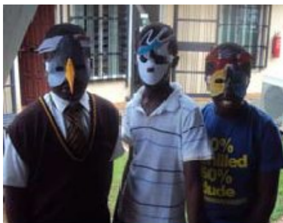
WBF activities in Nigeria

It was a great opportunity for pupils who attended the walk, to know and appreciate their rich and diverse environment which needs to be conserved by them. BLB hopes that those children will become future leaders in conservation.