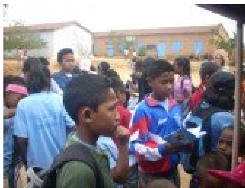
Activities of Asity at the 2010 WBF