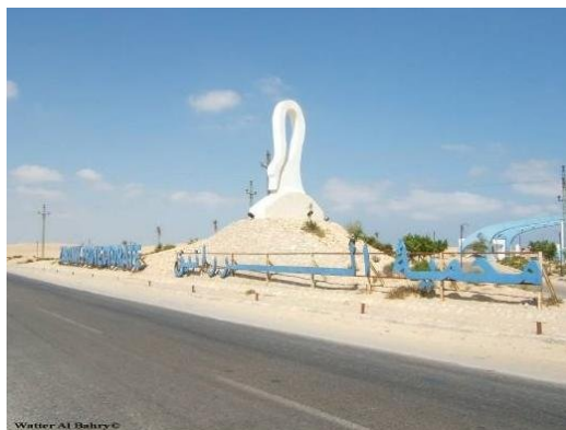
Birds are so important in people's culture

for humanity and as part of the IYB celebrations, the WBF reinforced this message, both in urban and rural settings.