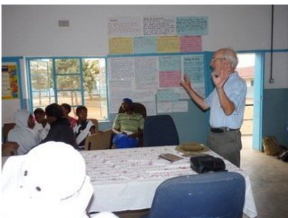
Ornithological skills and birdwatching at Mogobane