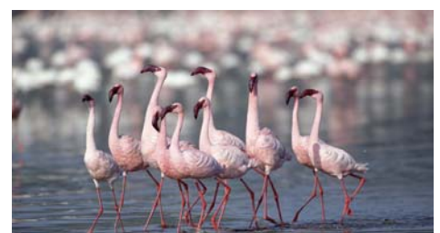
Lesser Flamingos at Lake Natron