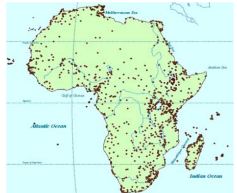
IBA network for Africa and other associated islands