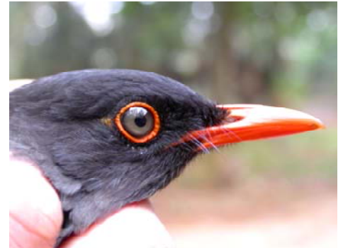
The Preventing Extinctions Initiative targets critically endangered species e.g. Taita Thrush