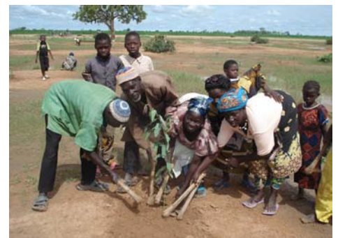
Restoration of the Sourou Valley IBA in Burkina Faso