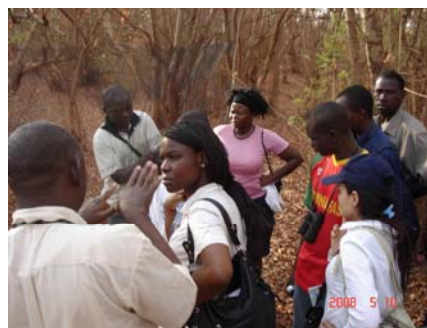
Participants at the workshop get a taste of fieldwork

This was the second workshop by the EC-funded "Instituting effective monitoring of biodiversity in Protected Areas (IBAs) as a contribution to reducing the rate of biodiversity loss in Africa" project. The project is implemented by BirdLife Partners in eight African countries and managed by the RSPB with coordination support from the BirdLife Africa Partnership Secretariat. The project is committed to delivering the highest possible standards of training.