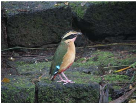
The African pitta is a really beautiful bird

The African Pitta , Pitta angolensis , is a migrant bird that breeds in central Tanzania, Malawi, southeast Democratic Republic of Congo, eastern Zambia, Zimbabwe, and possibly northern South Africa. During the non-breeding season, individuals migrate north into northern Tanzania, Rwanda, Burundi, Democratic Republic of Congo, Central African Republic, Uganda, and coastal Kenya.