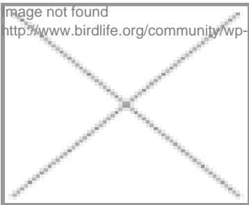
image not found http://www.birdlife.org/community/wp-content/uploads/2013/06/SY-300x244.png

Nature Seychelles has an outstanding record of practical