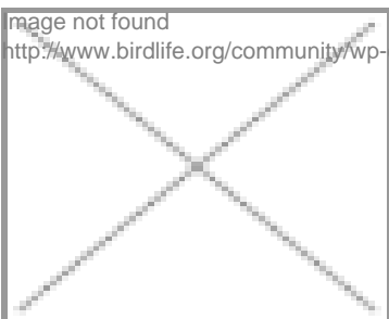
image not found http://www.birdlife.org/community/wp-content/uploads/2013/06/JO-300x244.png

Following a historic agreement with the Ministry of Environment, the