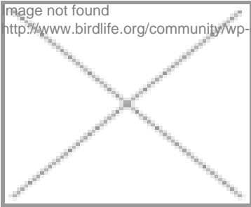
image not found http://www.birdlife.org/community/wp-content/uploads/2013/06/BO-300x244.png

Among other recent achievements, Asociacion Armonía (BirdLife