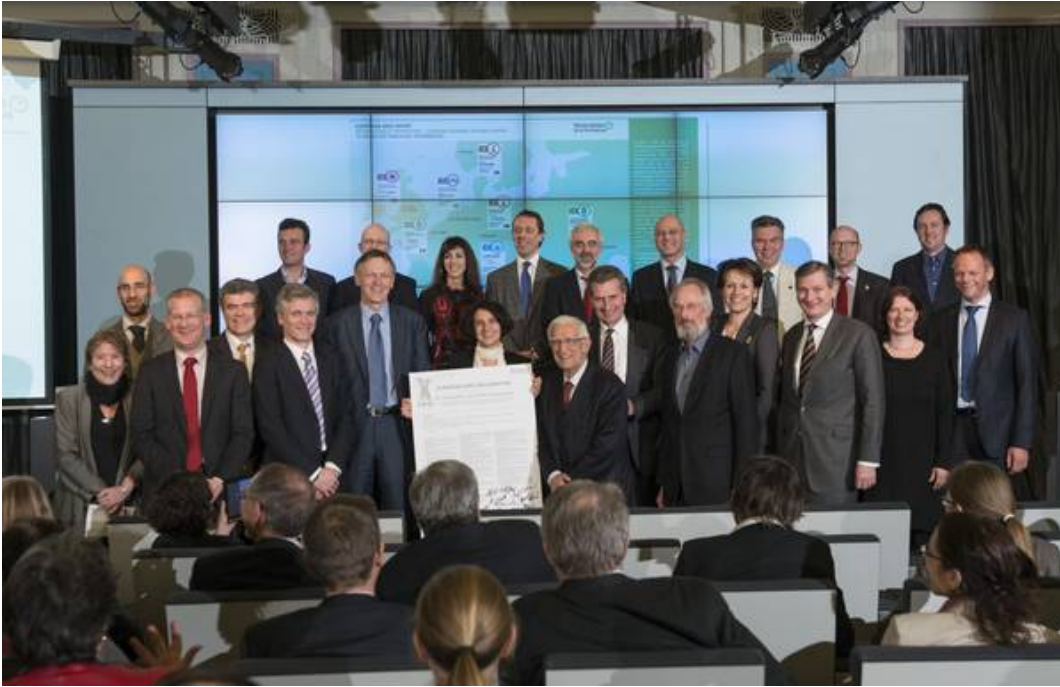
European Grid Report handed over to Commissioners Oettinger and Potocnik, RGI Conference, 5 December 2012.

Switching to renewable energy, along with reducing energy demand and using energy more efficiently, are at the heart of the needed response. BirdLife Europe supports large scale, rapid deployment of renewables and associated power lines. However, these technologies can have impacts on nature and the environment, if they are badly planned and sited. We work with industry, other NGOs and experts to find and promote solutions for sustainable deployment, to ensure investments combat climate change and also protect biodiversity and the environment. For example, in 2011 we produced " Meeting Europe Renewable Energy Targets in Harmony with Nature ", which was warmly welcomed by policy makers and renewables industries.