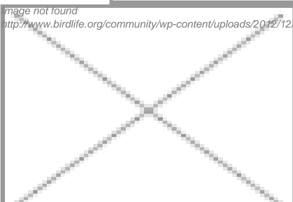
Students drawings. Finance: