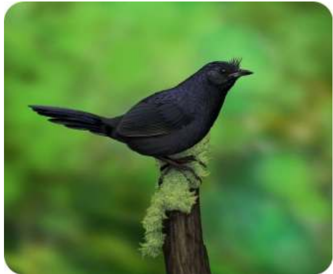
Digital artwork of Stresemann's Bristlefoot.