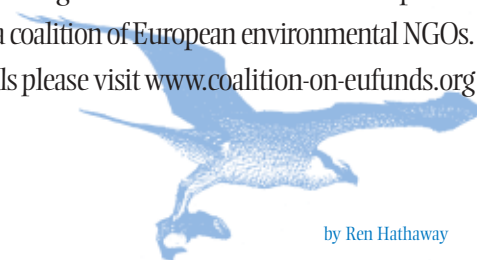
by Ren Hathaway

BirdLife is addressing the wider sustainable development issues as part of a coalition of European environmental NGOs. For further details please visit www.coalition-on-eufunds.org