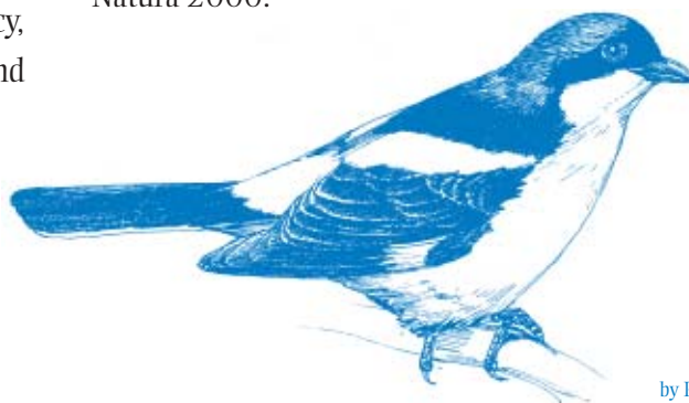
by Pavel Prochazka

We look to the Luxembourg Presidency to stimulate communication and agreement between different Council formations on the need to provide sufficient financing for Natura 2000.