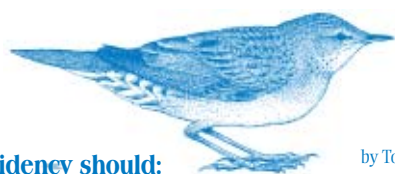
by Tomasz Cofa

In February, the Commission published a Communication on the future Financial Perspectives for the European Union. The Communication entitled " Building our Common Future: Policy Challenges and budgetary means of the Enlarged Union 2007-2013 ", outlines the Commission's views for the budgetary needs of the Union for the period 2007-2013. This was followed by a further Communication in July and two packages of legislative proposals, including the Rural Development, Structural Funds and 'LIFE+' proposals for 2007-2013.