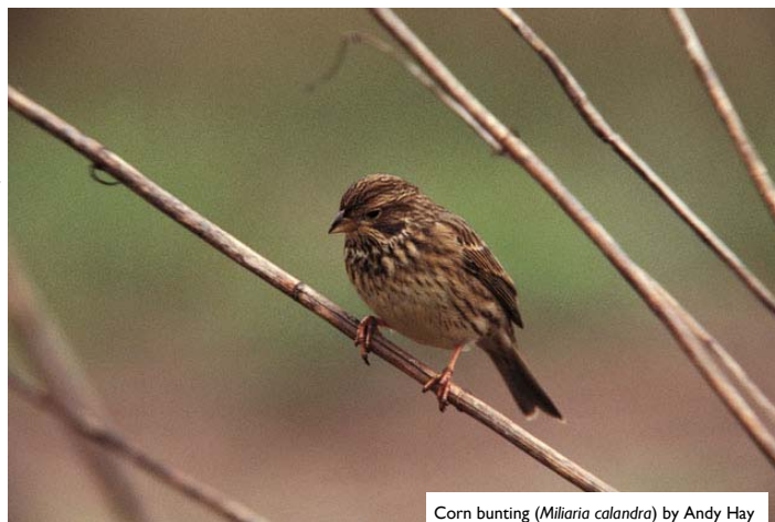
Corn bunting ( Miliaria calandra)