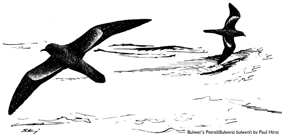
Bulwer's Petrel ( Bulweria bulwerii)