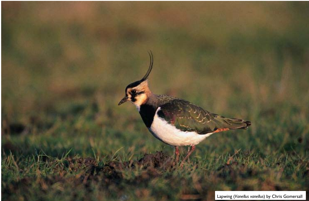
Lapwing ( Vanellus vanellus ) by Chris Gomersall