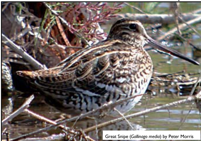
Great Snipe ( Gallinago media)

to increase the budget for this programme by transferring funds from Pillar I to Pillar II. As another matter of priority, BirdLife has been calling on EU decision-makers to allocate