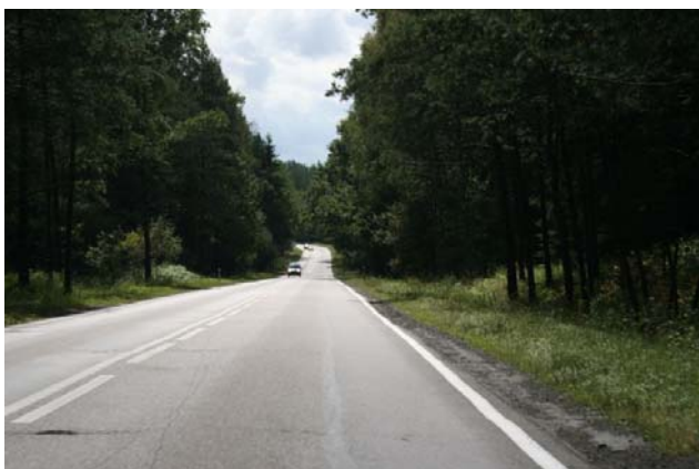
Katrynka – Przewalanka section of road no. 8 – planned for upgrade. Picture taken inside the Natura 2000 site.