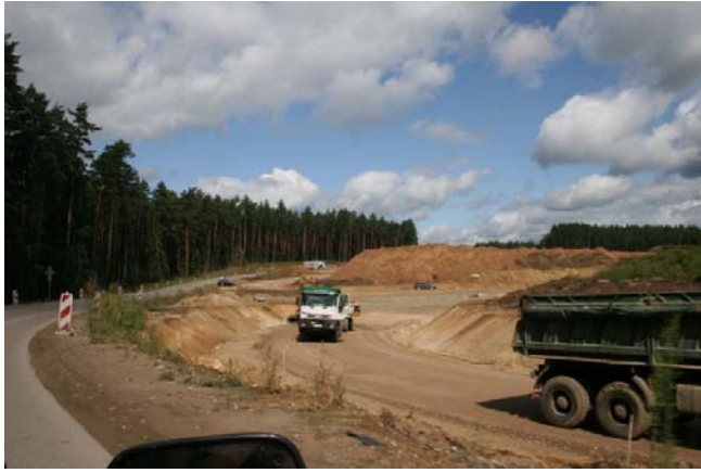
Białystok-Katrynka section of road no. 8 - under upgrading. Picture taken inside the Natura 2000 site, showing construction of the "Sochonie" road junction.