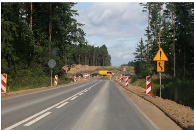
Białystok-Katrynka section of road no. 8 - under upgrading. Picture taken inside the Natura 2000 site, showing the "Sochonie" road junction.