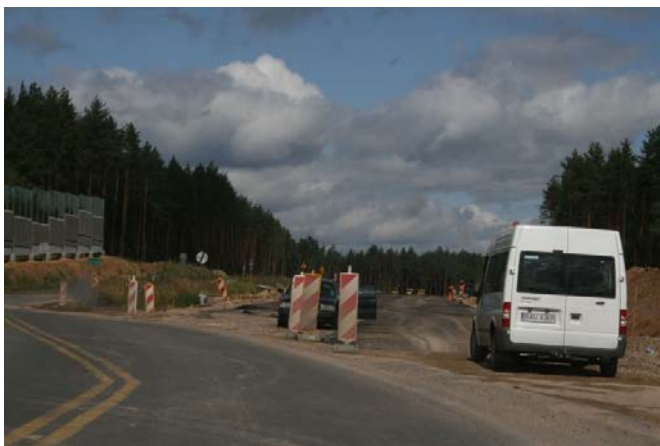
Białystok-Katrynka section of road no. 8 - under upgrading. Picture taken on the boundary of the Natura 2000 site.