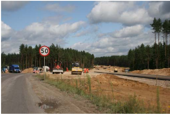
Białystok-Katrynka section of road no. 8 - under upgrading. Picture taken inside the Natura 2000 site.