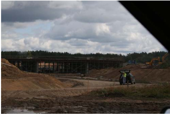
Białystok-Katrynka section of road no. 8 - under upgrading. Picture taken inside of the Natura 2000 site, showing construction of the "Sochonie" road junction construction and the planned connection with Wasilkow Bypass.