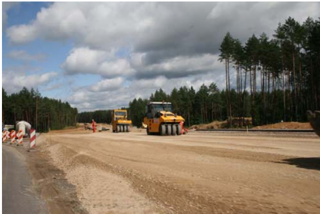
Białystok-Katrynka section of road no. 8 - under upgrading. Picture taken inside the Natura 2000 site.