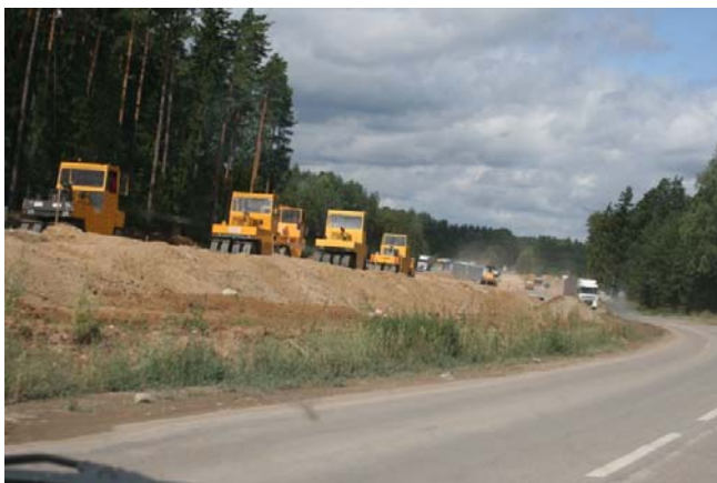
Białystok-Katrynka section of road no. 8 - under upgrading. Picture taken inside the Natura 2000 site.