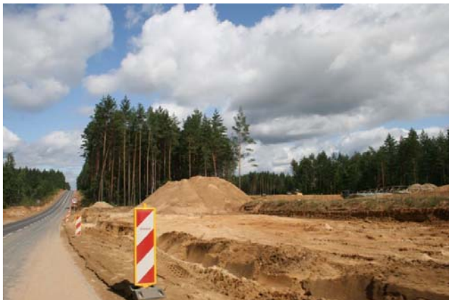
Białystok-Katrynka section of road no. 8 - under upgrading. Picture taken inside the Natura 2000 site.