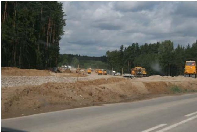
Białystok-Katrynka section of road no. 8 - under upgrading. Picture taken inside the Natura 2000 site.