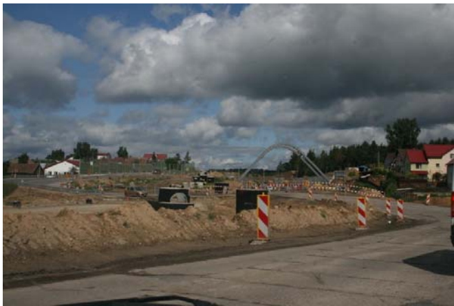
Białystok-Katrynka section of road no. 8 - under upgrading. Picture taken outside the Natura 2000 site.