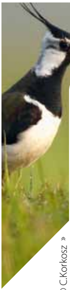
Northern Lapwing Vanellus vanellus »

“CAP should reward farmers who do more than simply baseline good agronomic practices.”