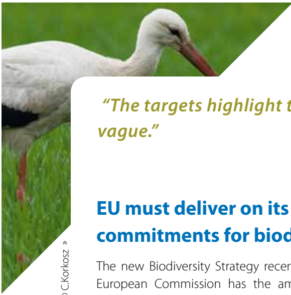
White Stork Ciconia ciconia © C.Korkosz »

“The targets highlight the right priorities but are either unambitious or vague.”