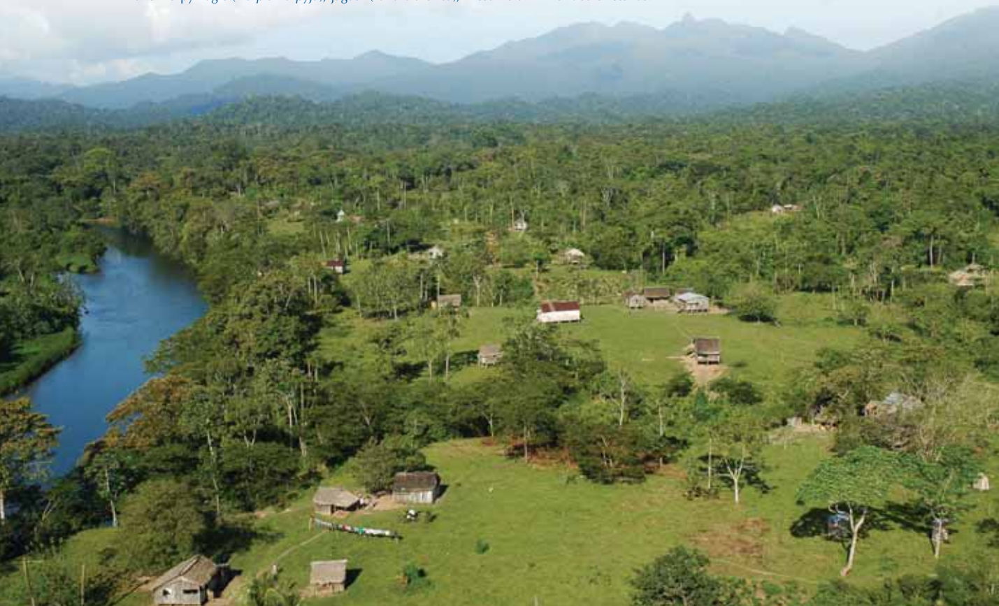
Miskito/Pech Indian village of Las Marias in the Río Plátano Biosphere Reserve (HN008).

manatee ( Trichechus manatus ) and giant anteater ( Myrmecophaga tridactyla ). It is also home to three indigenous groups, the Garífuna of Afro-Caribbean origin, and the Miskito and Pech Indians. Illegal logging, poaching, immigration, and attempts to convert northern portions of the reserve to oil palm plantations all threaten its integrity and continued existence.