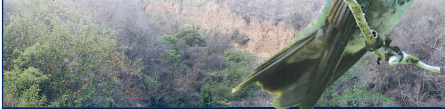
Thorn scrub in Valle de Aguán (HN006).

Conservation initiatives by Fundación Pico Bonito include the establishment of the first reserve for the species, Honduran Emerald Reserve in Yoro, public education and attempts to purchase private land in order to create other reserves.