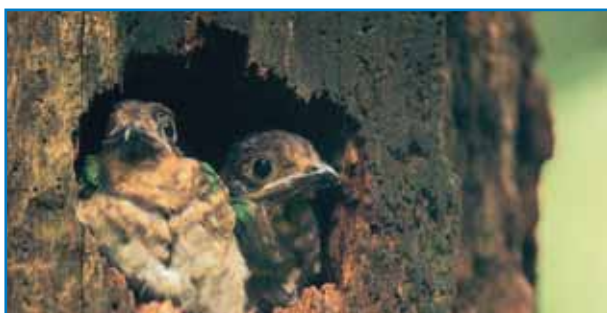
Near Threatened Resplendent Quetzal ( Pharomachrus mocinno) chicks in La Muralla National Park (HN011).

Habitat heterogeneity is another factor important in influencing Honduras's great diversity of birds. Honduras is a mountainous country with a great extent of coniferous forests, yet has a humid coastal plain along the Caribbean north coast and a more arid plain along the Pacific coast.