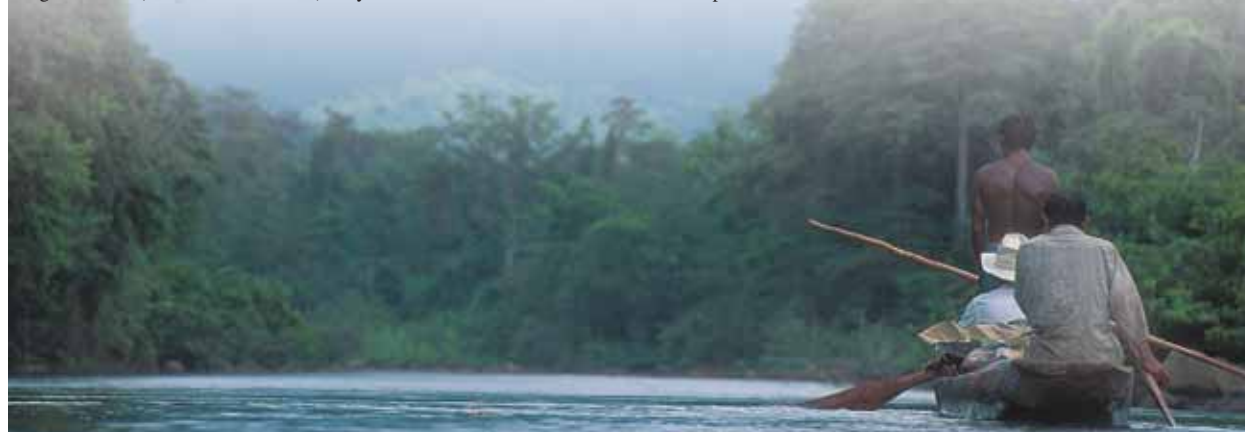
Dugout canoe or pipante on the río Plátano with Río Plátano Biosphere Reserve in the distance.

Principal habitat types are submontane and montane pine forests, cloud forests, lowland rain forest, dry tropical forests and wetlands on both coasts. Three IBAs also include significant portions of artificial terrestrial landscapes.