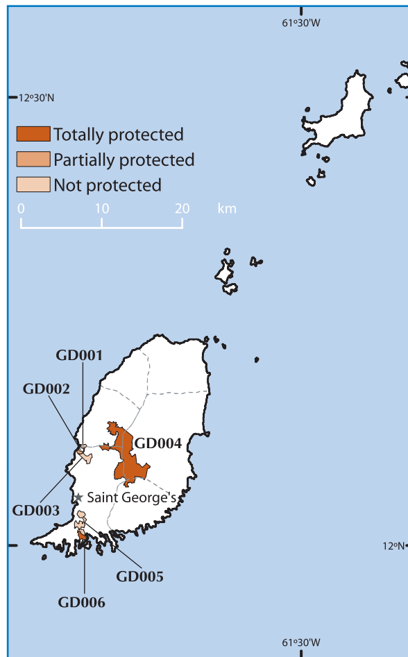
Figure 1. Location of Important Bird Areas in Grenada

“Five of Grenada's six IBAs have been identified primarily for the Critically Endangered Grenada Dove, supporting almost the entire species' population of 136 individuals.”