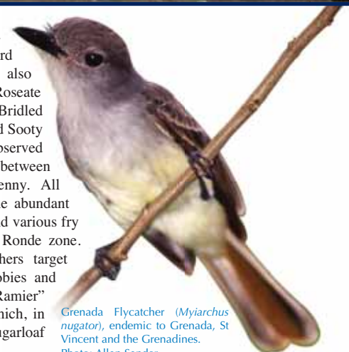
Grenada Flycatcher ( Myiarchus nugator ), endemic to Grenada, St Vincent and the Grenadines.

Brown Noddy ( Anous stolidus ) and Red-billed Tropicbird ( Phaethon aethereus ) are also found on these islands. Roseate Tern ( Sterna dougallii ), Bridled Tern ( Sterna anaethetus ), and Sooty Tern ( Sterna fuscata ) were observed (2004) around the islands between Carriacou and Kick-em-Jenny. All of these birds depend on the abundant fish (schools of anchovies and various fry or “pischet”) in the Isle la Ronde zone. Fishermen and other poachers target the young (fat-chested) boobies and Scaly-naped Pigeon or “Ramier” ( Patagioenas squamosa ), which, in 1987, were abundant on Sugarloaf and Sandy Islands.