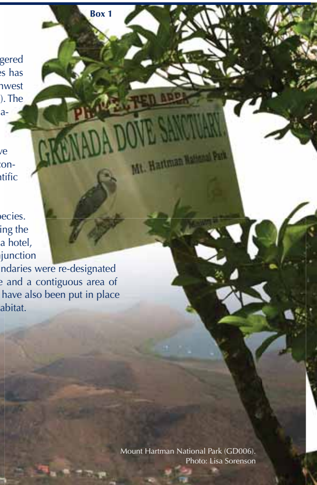
Mount Hartman National Park (GD006).

The only globally threatened bird present on the island is Grenada Dove ( Leptotila wellsi ; Box 1). The Near Threatened Caribbean Coot ( Fulica caribaea ) occurs on Grenada with 30 individuals recorded from Lake St Antoine in 1971, and an unspecified number again in 1987. However, there are no recent reports documenting the current status of the species on the island. The Near Threatened Buff-breasted Sandpiper ( Tryngites subruficollis ) is a very rare migrant on the island.