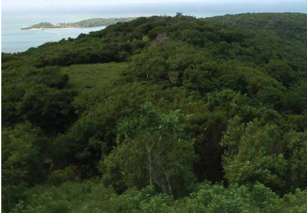
Dry forest at Mount Hartman (GD006), south-west Grenada. This IBA is the single most important site for the Critically Endangered Grenada Dove ( Leptotila wellsi ), supporting approximately 37% of the global population.

About 23% of Grenada is currently forested: c.4000 ha as higher elevation forests and c.3000 ha of evergreen, semi-evergreen and deciduous seasonal forest and woodland. Almost 70% of this forest area is Crown land. However, most of Grenada’s protected land (primarily the Grand Etang Forest Reserve and the proposed Mount St Catherine Forest Reserve) cover just the high elevation montane forest-types leaving the seasonal forest, deciduous forest, dry woodlands, dry coastal scrub and mangrove forest very poorly protected. Grenada lies south of the hurricane belt, and before Hurricane Ivan (September 2004) and Emily (July 2005), the last hurricane to hit the island was in 1955 (Janet). Hurricane Ivan had a profoundly devastating effect on the island’s economy, agricultural sector and ecosystems (including those on which Grenada Dove depends). Biodiversity on the island is being affected by a range of factors (mostly related to development and agricultural pressures) which are described under the IBA profiles in BirdLife International (2008) and Data Zone. However, the introduction of the mongoose ( Herpestes auropunctatus ) during the 1880s is particularly notable. This alien invasive predator is now abundant and is thought to be having a significant impact on Grenada’s mammal, bird and herpetofauna.