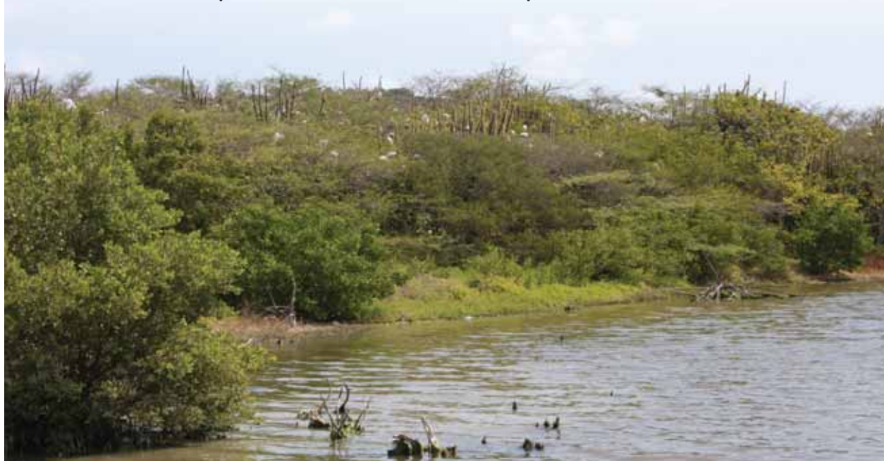
Egret colony at McKinnon's Saltpond (AG003), one of only two New World breeding sites for Little Egret ( Egretta garzetta ).

Effective biodiversity conservation is severely constrained by the dearth of trained staff in both the government and NGO sectors, a lack of biological knowledge, and inadequate investment by a debt-ridden government. These shortcomings are highlighted in the National Biodiversity Strategy and Action Plan which emphasizes the need for protected area and critical species management plans and for strengthened capacities in government and NGOs to manage biodiversity. Habitat loss, degradation and disturbance are serious conservation concerns. Wetland habitats in particular are under pressure on Antigua. They are converted to other uses (e.g. human settlement, tourism, and agriculture); degraded through clear-cutting of mangroves and swamp forest for lumber and agriculture; polluted with sewage, industrial water and pesticides; and impacted by natural catastrophes such as drought and hurricanes whose local effects are exacerbated by