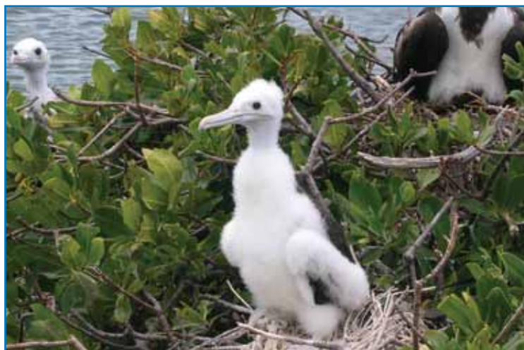
Magnificent Frigatebird ( Fregata magnificens ) chick at Codrington Lagoon - the Caribbean's largest frigatebird colony.

Antigua and Barbuda are emergent parts of a 3400 km 2 submarine platform. The depth of water between the two islands is just 27 to 33 m. Antigua is 19 km across (east to west) and 15 km from north to south. It has an intricate, deeply indented coastline with numerous islands, creeks, inlets and associated sand-bars (behind which wetlands have developed). A large portion of the east, north and south coasts are protected by fringing reefs. A flat, low-lying dry central plain gives rise to gently rolling limestone hills and valleys (vegetated with xeric scrub) in the north and east. The higher, volcanic mountains of the south-west support moist evergreen forest. Barbuda is a low limestone island with a less varied coastline although it supports extensive reef systems, especially off the east coast. Codrington Lagoon in the northwest is a large, almost enclosed saltwater lagoon bordered by mangroves and sand ridges. An area of highlands (c.35 m high) on the eastern side of the island is an escarpment with a scarp slope on the north and west, a gentle slope to the south, and sea cliffs on the east. Redonda is the cone of a volcano that rises abruptly from the sea in steep cliffs that surround the island. Antigua and Barbuda support some of the most extensive mangrove woodlands in the eastern Caribbean.