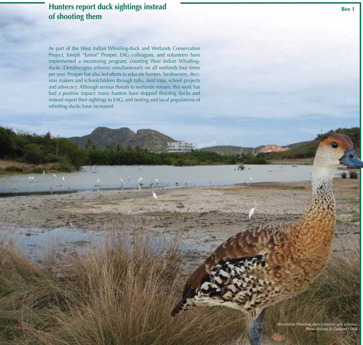
West Indian Whistling-duck ( Dendrocygna arborea).