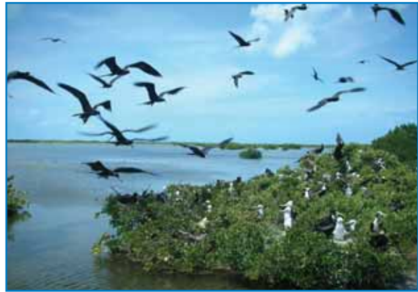
Magnificent Frigatebirds at Codrington Lagoon (AG002), the Caribbean’s largest frigate-bird colony.

Barbuda supports the Caribbean’s largest colony of Magnificent Frigatebird ( Fregata magnificens ) with the population estimated at 5300 individuals (1743 occupied nests) in March 2008. Little is known about the current status (or population sizes) of the country’s other breeding seabirds although surveys by EAG are being undertaken. An interesting recent addition to Antigua’s breeding avifauna is the Little Egret ( Egretta garzetta ). Previously known to breed only on Barbados within the Western Hemisphere, three nests (and an island population of 12 birds) were documented on Antigua in March 2008 (Kushlan in press).