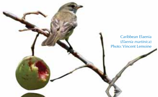
Caribbean Elaenia ( Elaenia martinica )

Most of Antigua and Barbuda’s IBAs meet two or more criteria (Table 1), quite often combining significance for congregatory waterbirds/seabirds with restricted-range birds and/or globally threatened birds. For many of the congregatory species, significant populations (i.e. >1% of the global or biogeographic population of the species) are only found in one IBA. Codrington Lagoon and Creek IBA (AG002) is significant not just as the largest Magnificent Frigatebird ( Fregata magnificens ) colony in the Caribbean, but also as the only IBA where the globally Near Threatened (and endemic) Barbuda Warbler ( Dendroica subita ) occurs, and also the only IBA in the country where the restricted-range Lesser Antillean Flycatcher ( Myiarchus oberi ) is found. Wallings Forest IBA (AG008) and Christian Valley IBA (AG009) together represent Antigua’s wet forest ecosystem and are the only IBAs in the country where the restricted-range Bridled Quail-dove ( Geotrygon mystacea ), Antillean Euphonia ( Euphonia musica ), Scaly-breasted Thrasher ( Margarops fuscus ) and Pearly-eyed Thrasher ( M. fuscatus ) are found, highlighting their critical importance in maintaining Antigua’s biodiversity.