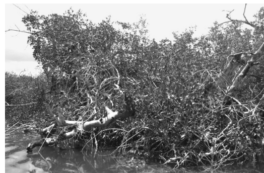
Mangroves, Ria Lagartos Biosphere Reserve, Mexico