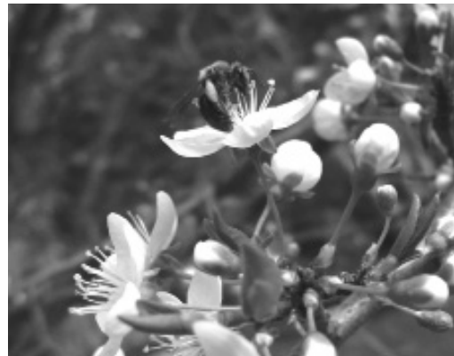
Bee and plum blossom, Canada

118. Climate change increases the risk of reductions in crop and livestock yields. Within a given region, different crops and livestock are subject to different degrees of impacts from current and projected climate change. 141 In light of this, the adoption of specific crops, livestock or varieties in areas and farms where they were not previously grown are among the adaptation options available to farmers. 142 Further, the use of currently under-utilized crops and livestock can help to maintain diverse and more stable agroecosystems. 143 Conserving crop and livestock diversity in many cases helps maintain local knowledge concerning management and use.