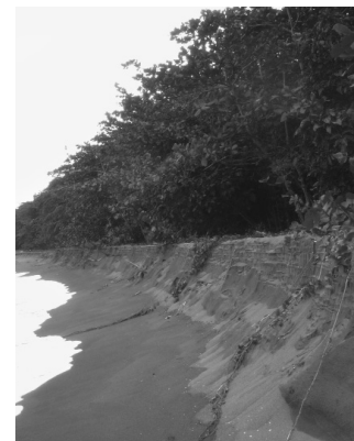
Coastal erosion, Costa Rica