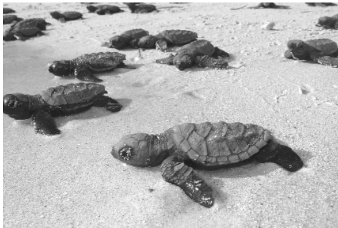
Hawksbill turtles, Nicaragua, Photo courtesy of Sonia Gautreau

18. Further climate change will have increasingly significant direct impacts on biodiversity. Increased rates of species extinctions are likely 26 , with negative consequences for the services that these species and ecosystems provide. Poleward and elevational shifts, as well as range contractions and fragmentation, are expected to accelerate in the future. Contractions and fragmentation will be particularly severe for species with limited dispersal abilities, slower life history traits, and range restricted species such as polar and alpine species 27 and species restricted to riverine 28 and freshwater habitats 29 . Local extinction of species often occurs with a substantial delay following habitat loss or degradation. Accumulating evidence suggests that such extinction debts pose a significant but often unrecognized challenge for biodiversity conservation across a wide range of taxa and ecosystems 30 . Shifts in distributions of native species as an adaptive response to climate change will challenge current wildlife and conservation management practices and approaches.