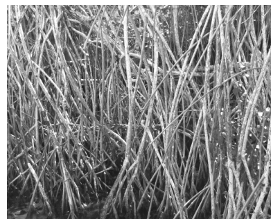
Mangroves, Quintana Roo, Mexico

139. The conservation of existing primary forests where there is currently little deforestation or forest degradation occurring, provides important opportunities for both protecting carbon stocks and preventing future greenhouse emissions, as well as for conserving biodiversity. Most of the biomass carbon in a primary forest is stored in older trees or the soil. 198 Land-use activities that involve clearing and logging reduce the standing stock of biomass carbon, cause collateral losses from soil, litter and deadwood and have also been shown to reduce biodiversity and thus ecosystem resilience. 199 This creates a carbon debt which can take decades to centuries to recover, depending on initial conditions and the intensity of land use. 200 Conserving forests threatened by deforestation and forest degradation and thus avoiding potential future emissions from land use change is therefore an important climate change mitigation opportunity for some countries. 201 Avoiding potential future emissions from existing carbon stocks in forests, especially primary forests, can be achieved through a range of means 202 including: