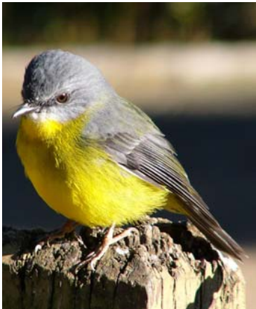
Eastern Yellow Robin, a bird native to Australia, is both widespread and common within its range. It is found in a wide range of habitats from dry woodland to rainforest, but it is also common in parks and gardens. Its familiarity in these habitats, and its often confiding nature, raise the public awareness of birds.

Barn Swallow is the world's most widespread species of swallow. It breeds in the northern hemisphere, migrating to warmer climes in the southern hemisphere in the non-breeding season. In both seasons, it is often found in close association with man.