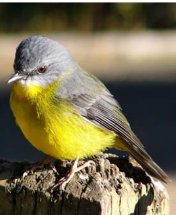
Eastern Yellow Robin, a bird native to Australia, is both widespread and common within its range. It is found in a wide range of habitats from dry woodland to rainforest, but it is also common in parks and gardens. Its familiarity in these habitats, and its often confiding nature, raise the public awareness of birds.

Barn Swallow is the world's most widespread species of swallow. It breeds in the northern hemisphere, migrating to warmer climes in the southern hemisphere in the non-breeding season. In both seasons, it is often found in close association with man.