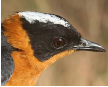
With a widespread range in Africa, Snowy-crowned Robin-chat is a bird typical of forest and savannah. It is common in parts of its range, although population trends have not been quantified.

The Global Wild Bird Indicator Project will develop the global WBI from national population monitoring schemes. Where such schemes already exist, the Project will coordinate and facilitate the collation of species indices using data generated by these schemes. Where there are no schemes at present, the Project will provide tools and support to implement similar data collation and synthesis in a representative set of countries across regions. A key tool will be the web-based Worldbirds , which will support the collation of data in the form of species lists and bird surveys.