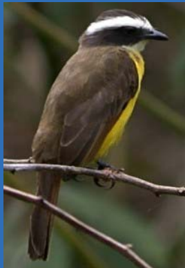
Rufous-tailed Jacamar & Rusty-margined Flycatcher, both native to South America.