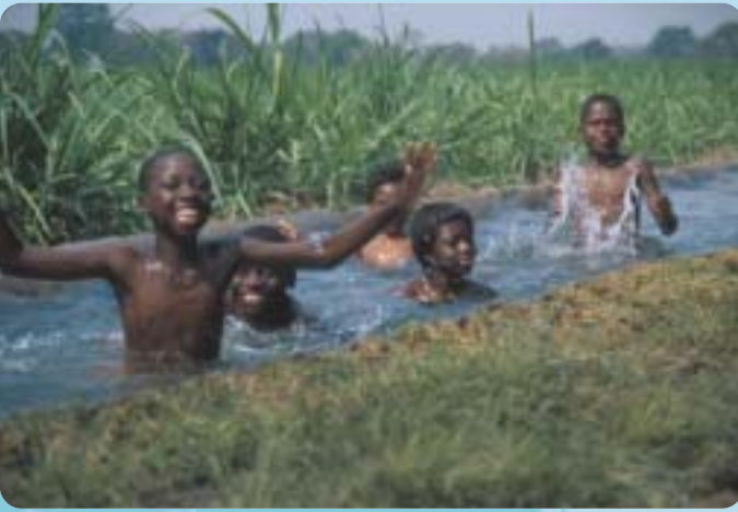
Sarah Black, WWF-Canon