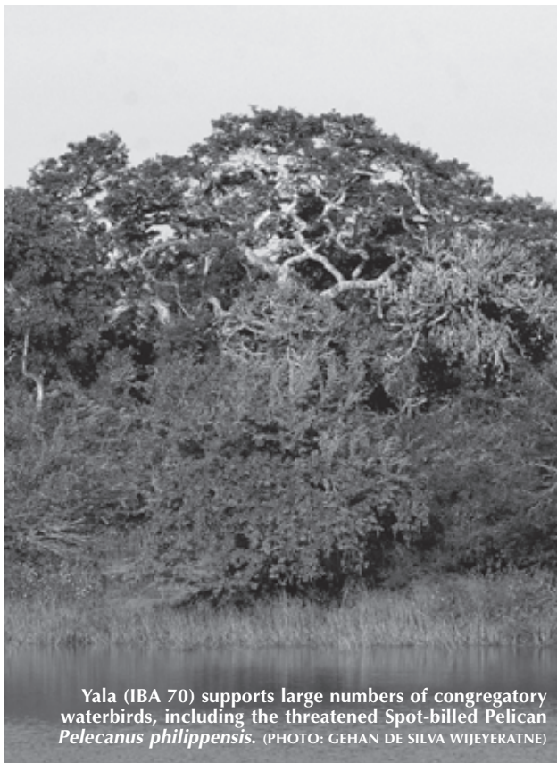
Yala (IBA 70) supports large numbers of congregatory waterbirds, including the threatened Spot-billed Pelican Pelecanus philippensis.

Three Ramsar Sites have been designated in Sri Lanka, two of which overlap with IBAs. An additional 24 potential Ramsar Sites have been identified, many of which are important breeding and feeding areas for Spot-billed Pelican.