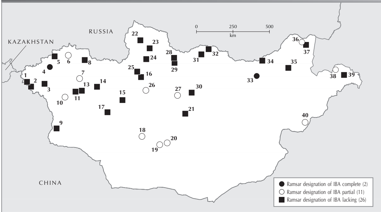
Summary of Important Bird Areas that contain areas that qualify as Ramsar Sites in Mongolia.