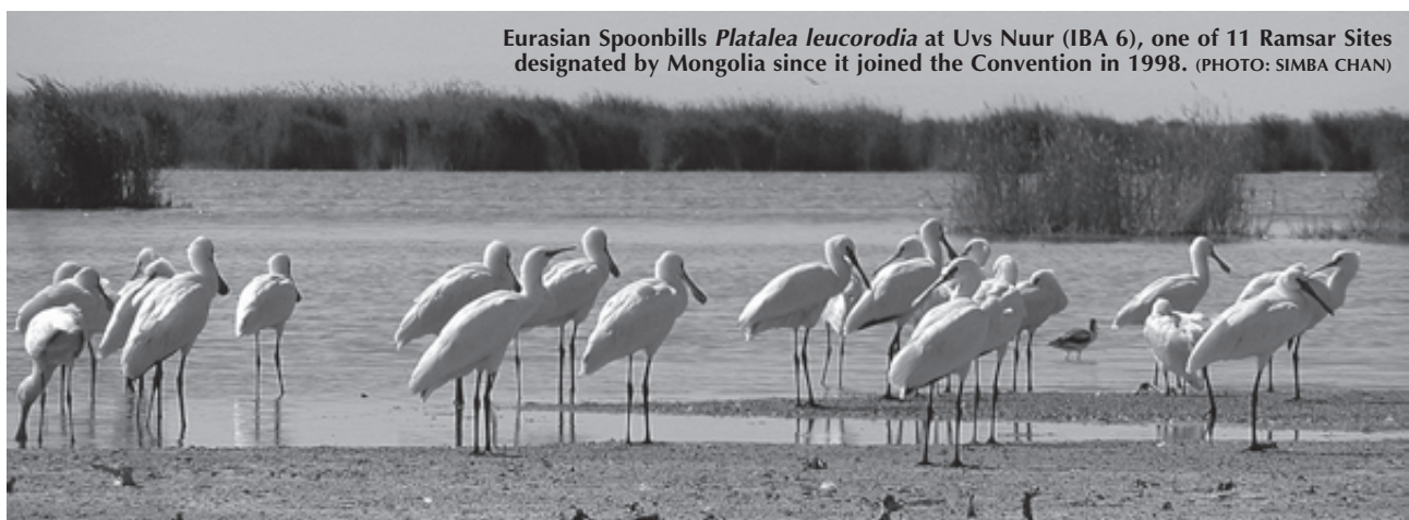
Eurasian Spoonbills Platalea leucorodia at Uvs Nuur (IBA 6), one of 11 Ramsar Sites designated by Mongolia since it joined the Convention in 1998.