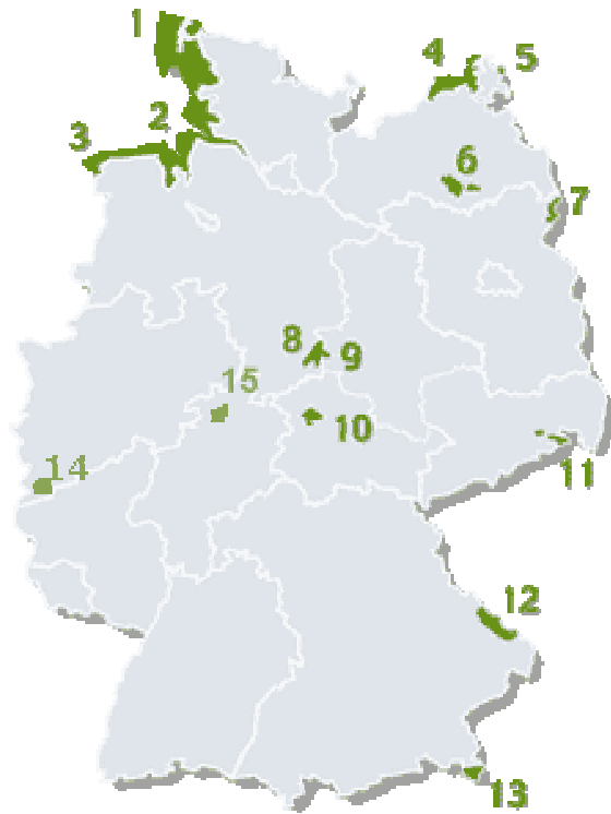
national parks (15)

protected forests without forest management: less than 2,5 %