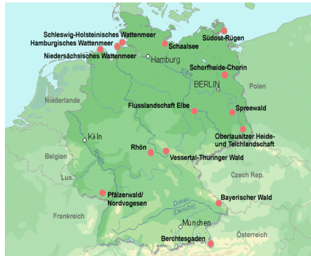
biosphere reserves (14)