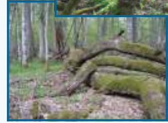
Andrzej Bobiec The amount of dead wood in the European forests is likely to decrease further for its use as fuelwood

These factors resulted in one of the most promising options for saving forest and atmosphere dropping from the Kyoto Protocol for the first commitment period. Yet improved anti-deforestation measures in the protocol could function well for emission reductions, bring economic benefits to rural areas in the forested-saving country, prevent floods, and preserve biodiversity. Kyoto provisions currently contain no other market mechanisms or economic incentives at a global scale to prevent deforestation.