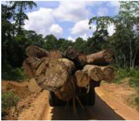
Work on the initiative by the BirdLife Partnership successfully halted logging in the northern section of the Harapan rainforest in August 2006.

Large areas of Harapan Rainforest retain a close canopy