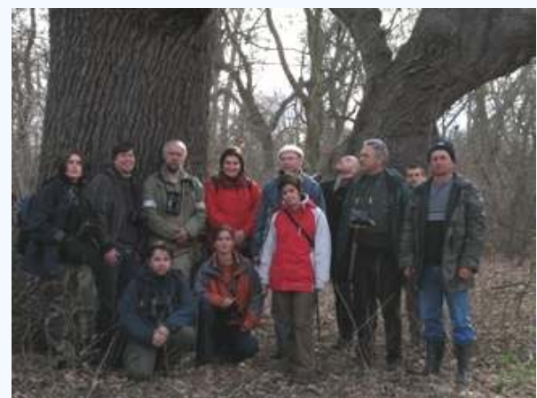
Oak forests on sand dunes is a unique forest type in the Danube Delta

and Romania, which will help to locate gaps in the current networks of forest protected areas, and in systematic planning of national forest protected area networks. Further on, the results of the BRFM project will support the development of the national Natura 2000 network and define priorities for management plans in pilot Natura 2000 sites. The results will also be applicable in the process FSC certification where HCVFs are required to be maintained or enhanced during forestry operations. The results will be actively communicated to all the central stakeholders including authorities responsible for forest protection and management, forest industries, and nature conservation organisations. Based on experience from the previous projects it is intended to also present model forests where management considering particularly biodiversity conservation will be demonstrated in cooperation with local forest administrations.